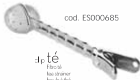
clip té filtro té tea strainer boule à thé