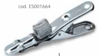
clip glasses porta penna e occhiali pen and glasses holder porte stylo / lunettes