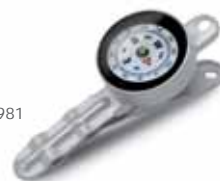
clip nord bussola compass clip pinche boussole