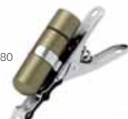
clip pills porta pillole pillbox clip boite a pilules