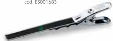
clip gradi termometro thermometer thermometre