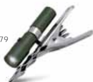
clip pila torcia led flashlight clip lampe de poche