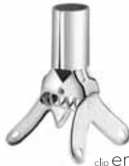
clip emma portacandele candle holder bougeoir