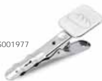
clip bread chiudi sacchetto bag clip pinche a sachet