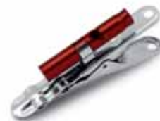
clip tweet fischietto whistle clip pinche sifflet