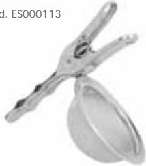
clip sana filtro tisane herbal tea strainer passette à thé