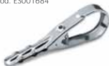
clip clasp moschettone can carabinier mousqueton