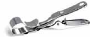
clip keys appendi chiavi hanging keys accroche-cles