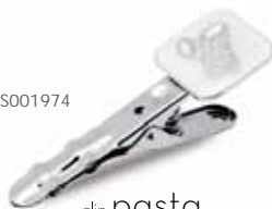
clip pasta chiudi sacchetto bag clip pinche a sachet