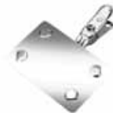
clip allo porta-foto photo holder porte-photos