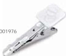
clip coffee chiudi sacchetto bag clip pinche a sachet