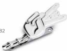
clip papier porta carte paperweight presse-papier