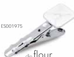
clip flour chiudi sacchetto bag clip pinche a sachet