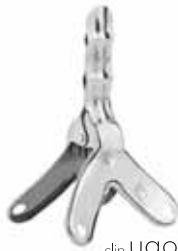
clip ugo segnaposto place holder marque-place