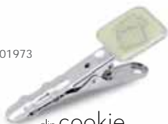
clip cookie chiudi sacchetto bag clip pinche a sachet