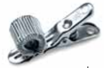
clip agenda porta penna pen holder porte stylo