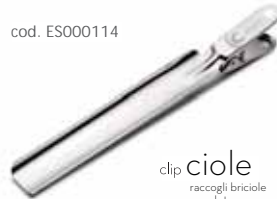
clip cirole raccogli briciole crumb tray ramasse miettes