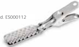
clip gina grattugina noce moscata nutmeg grater rape à noix de muscade