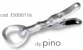
clip pino apri bottiglie bottle opener ouvre-bouteille