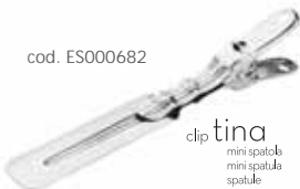
clip tina mini spatola mini spatula spatule