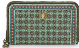
51.273.360 Wallet 18x3x11 cm Clover Green 60% PVC - 20% PU - 20% Polyester Compartment: 1 - Pockets: 5 Fits 5 cards 1/60