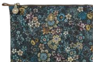
NEW | 51.274.233 Charly Cosmetic Flat Pouch Medium 24x1x15.5 cm Tutti i Fiori Blue 60% Polyester - 40% PVC Compartment: 1 - Pocket: 1 - Ltr: 0.3 1/48