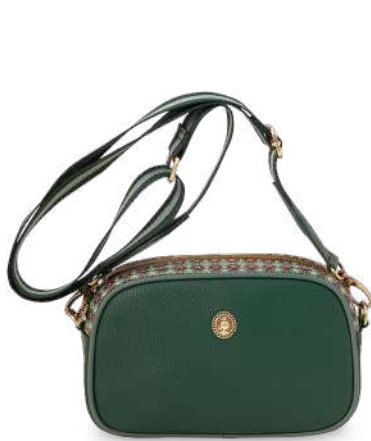
NEW | 51.273.388 Frida Cross Body Bag Small 21x6x13 cm Green 40% PU - 30% PVC - 30% Polyester Compartment: 1 - Pockets: 2 - Ltr: 1.2 Detachable strap 1/24