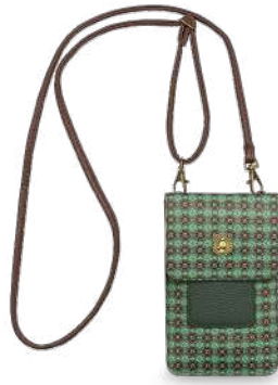
51.273.358 Phone Bag 11x1x18 cm Clover Green 90% PVC - 10% PU Compartment: 1 - Pocket: 1 - Ltr: 0.1 Detachable strap 1/48