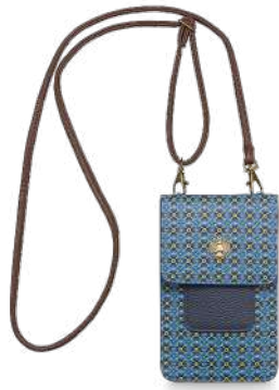
51.273.348 Phone Bag 11x1x18 cm Clover Blue 90% PVC - 10% PU Compartment: 1 - Pocket: 1 - Ltr: 0.1 Detachable strap 1/48