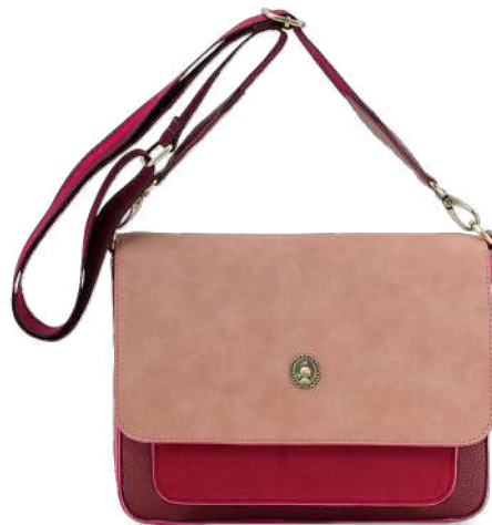
NEW | 51.273.382 Fenna Cross Body Flap Medium 25x7x20 cm Red 50% PU - 50% Polyester Compartments: 2 - Pockets: 3 - Ltr: 2 Detachable strap 1/12