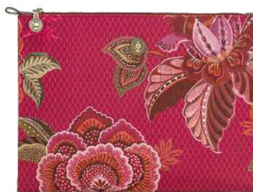
NEW | 51.274.244 Charly Cosmetic Flat Pouch Large 30x1x22 cm Cece Fiore Red 60% Polyester - 40% PVC Compartment: 1 - Pocket: 1 - Ltr: 0.4 1/60