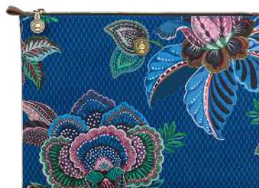
NEW | 51.274.236 Charly Cosmetic Flat Pouch Large 30x1x22 cm Cece Fiore Blue 60% Polyester - 40% PVC Compartment: 1 - Pocket: 1 - Ltr: 0.4 1/60