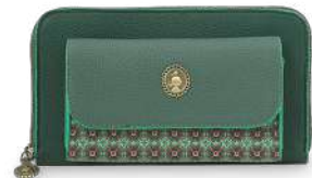
NEW | 51.273.386 Wally Wallet Pocket 19.5x4.5x11 cm Green 40% PU - 30% PVC - 30% Polyester Compartiments: 2 - Pockets: 3 Fits 16 cards 1/60