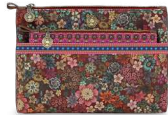
51.274.222 Cosmetic Bag Combi 26x7.5x18 cm/22x1x13 cm Tutti i Fiori Pink 60% Polyester - 40% PVC Compartments: 2 - Pockets: 2 - Ltr: 1.5 1/12