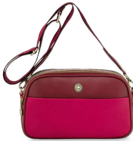
NEW | 51.273.380 Frida Cross Body Bag Medium 26.5x7.5x16.5 cm Red 40% PU - 30% PVC - 30% Polyester Compartment: 2 - Pockets: 2 - Ltr: 2.5 Detachable strap 1/16