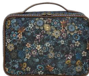
51.274.220 Beauty Case Square Large 27x10x19 cm Tutti i Fiori Blue 60% PVC - 40% Polyester Compartiments: 2 - Pockets: 2 - Ltr: 4 1/12