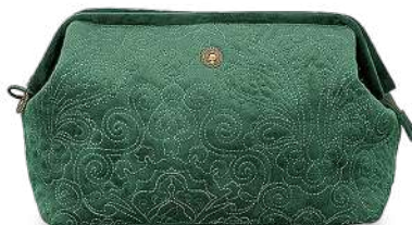
51.274.175 Cosmetic Purse Extra Large 30x13.8x20.7 cm Velvet Quiltey Green 60% Polyester Velvet - 40% PVC Compartment: 1 - Pockets: 3 - Ltr: 6 1/16