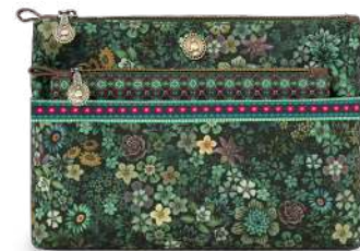
51.274.225 Cosmetic Bag Combi 26x7.5x18 cm/22x1x13 cm Tutti i Fiori Green 60% Polyester - 40% PVC Compartments: 2 - Pockets: 2 - Ltr: 1.5 1/12