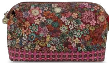
NEW | 51.274.242 Cooper Cosmetic Purse Large 26x12x18 cm Tutti i Fiori Pink 60% Polyester - 40% PVC Compartment: 1 - Pockets: 3 - Ltr: 4 1/24