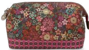
51.274.221 Cosmetic Purse Medium 22.5x9.5x15 cm Tutti i Fiori Pink 60% Polyester - 40% PVC Compartment: 1 - Pockets: 2 - Ltr: 2.3 1/36