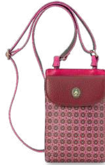
NEW | 51.273.378 Pippa Phone Bag 13.5x3x20 cm Clover Pink 40% PU - 30% PVC - 30% Polyester Compartment: 3 - Pocket: 1 - Ltr: 0.1 Fits 3 cards 1/48