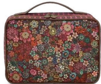
51.274.223 Beauty Case Square Large 27x10x19 cm Tutti i Fiori Pink 60% PVC - 40% Polyester Compartments: 2 - Pockets: 2 - Ltr: 4 1/12