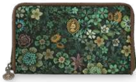
51.273.359 Wallet 18x3x11 cm Tutti i Fiori Green 50% Polyester - 40% PVC - 10% PU Compartment: 1 - Pockets: 5 Fits 5 cards 1/60