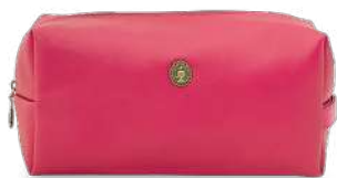
NEW | 51.274.237 Coco Cosmetic Bag Medium 21.5x10x10.5 cm Pink 40% PU - 30% PVC - 30% Polyester Compartment: 1 - Pockets: 2 - Ltr: 1.5 1/24