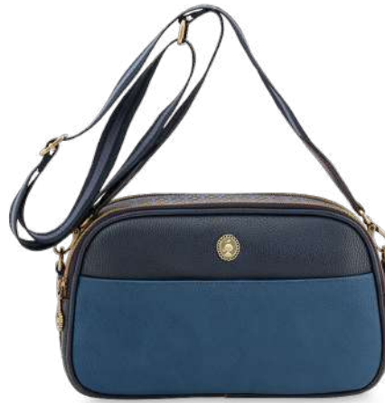
NEW | 51.273.371 Frida Cross Body Bag Medium 26.5x7.5x16.5 cm Blue 40% PU - 30% PVC - 30% Polyester Compartment: 2 - Pockets: 2 - Ltr: 2.5 Detachable strap 1/16