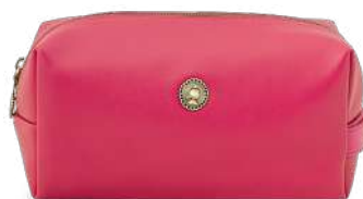
NEW | 51.274.238 Coco Cosmetic Bag Large 26x12x12.6 cm Pink 40% PU - 30% PVC - 30% Polyester Compartment: 1 - Pockets: 2 - Ltr: 3 1/18