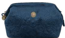
51.274.215 Cosmetic Purse Small 19x8.5x12 cm Velvet Quiltey Days Blue 60% Polyester Velvet - 40% PVC Compartment: 1 - Pockets: 2 - Ltr: 1 1/36