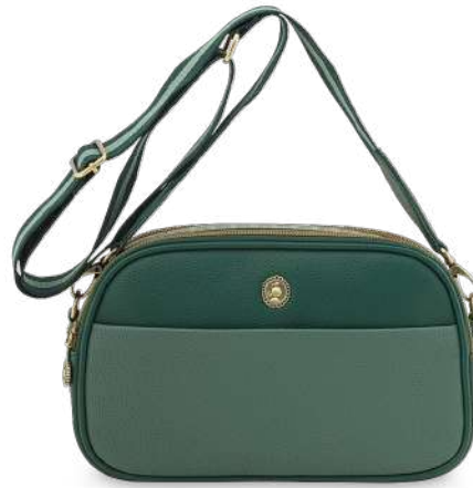
NEW | 51.273.389 Frida Cross Body Bag Medium 26.5x7.5x16.5 cm Green 40% PU - 30% PVC - 30% Polyester Compartiments: 2 - Pockets: 2 - Ltr: 2.5 Detachable strap 1/16