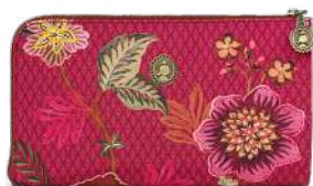
NEW | 51.274.243 Cloe Cosmetic Zipper Pouch 21x3.5x12.5 cm Cece Fiore Red 60% Polyester - 40% PVC Compartment: 1 - Ltr: 0.1 1/64