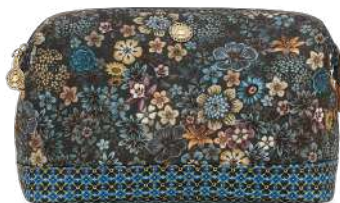
NEW | 51.274.234 Cooper Cosmetic Purse Large 26x12x18 cm Tutti i Fiori Blue 60% Polyester - 40% PVC Compartment: 1 - Pockets: 3 - Ltr: 4 1/24