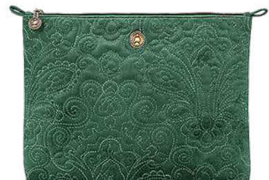
51.274.176 Cosmetic Flat Pouch Large 30x1x22 cm Velvet Quiltey Green 60% Polyester Velvet - 40% PVC Compartment: 1 - Pocket: 1 - Ltr: 0.4 1/60