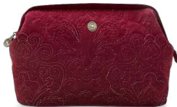
51.274.190 Cosmetic Purse Extra Large 30x13.8x20.7 cm Velvet Quiltey Days Red 60% Polyester Velvet - 40% PVC Compartment: 1 - Pockets: 3 - Ltr: 6 1/16