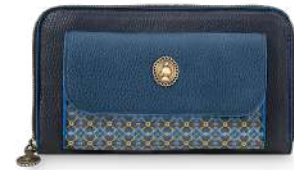
NEW | 51.273.368 Wally Wallet Pocket 19.5x4.5x11 cm Blue 40% PU - 30% PVC - 30% Polyester Compartment: 2 - Pockets: 3 Fits 16 cards 1/60