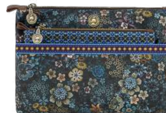
51.274.219 Cosmetic Bag Combi 26x7.5x18 cm/22x1x13 cm Tutti i Fiori Blue 60% Polyester - 40% PVC Compartiments: 2 - Pockets: 2 - Ltr: 1.5 1/12