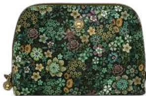
NEW | 51.274.248 Coby Cosmetic Bag Triangle Medium 24/17x8x16.5 cm Tutti i Fiori Green 60% Polyester - 40% PVC Compartment: 1 - Pockets: 3 - Ltr: 1.2 1/24