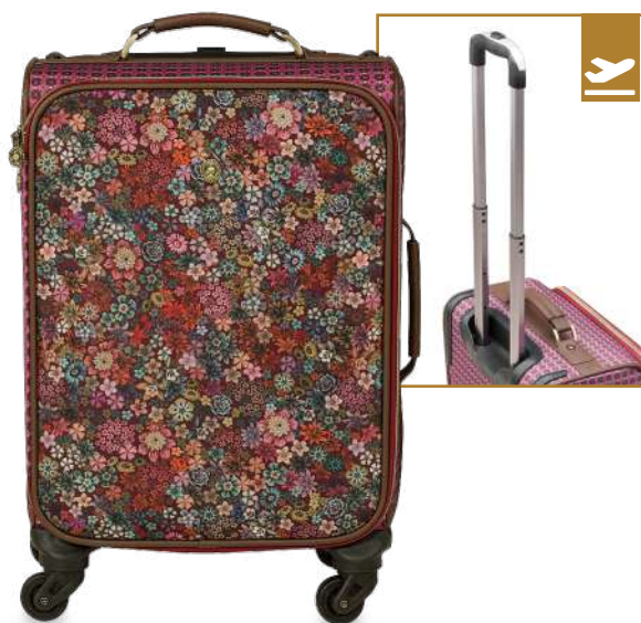
NEW | 51.273.385 Tosca Trolley 35x22x47 cm Tutti i Fiori Pink 60% Polyester - 30% PVC - 10% PU Compartment: 1 - Pockets: 3 - Ltr: 24 1/1 - Cabin Size Spinner