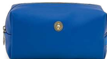
NEW | 51.274.230 Coco Cosmetic Bag Large 26x12x12.6 cm Blue 40% PU - 30% PVC - 30% Polyester Compartment: 1 - Pockets: 2 - Ltr: 3 1/18