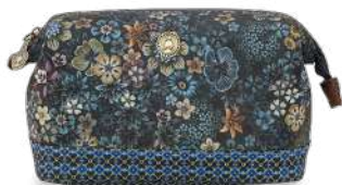
51.274.218 Cosmetic Purse Medium 22.5x9.5x15 cm Tutti i Fiori Blue 60% Polyester - 40% PVC Compartment: 1 - Pockets: 2 - Ltr: 2.3 1/36