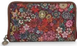
51.273.354 Wallet 18x3x11 cm Tutti i Fiori Pink 50% Polyester - 40% PVC - 10% PU Compartment: 1 - Pockets: 5 Fits 5 cards 1/60