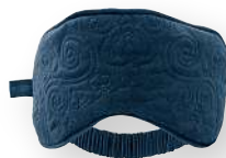
51.530.010 Sleeping Mask One size Velvet Quiltey Days Blue 100% Polyester Velvet 1/200