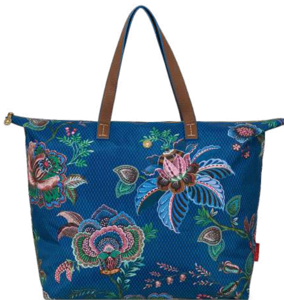
NEW | 51.273.374 Tilda Tote Bag 66x20x44 cm Cece Fiore Blue 60% Polyester - 30% PVC - 10% PU Compartment: 1 - Pockets: 3 - Ltr: 17 1/24