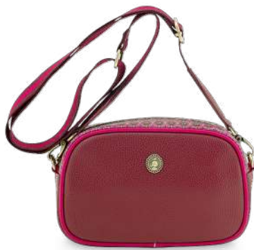
NEW | 51.273.379 Frida Cross Body Bag Small 21x6x13 cm Red 40% PU - 30% PVC - 30% Polyester Compartment: 1 - Pockets: 2 - Ltr: 1.2 Detachable strap 1/24