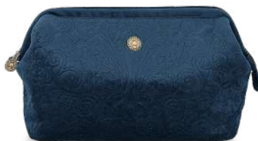
51.274.217 Cosmetic Purse Extra Large 30x13.8x20.7 cm Velvet Quiltey Days Blue 60% Polyester Velvet - 40% PVC Compartment: 1 - Pockets: 3 - Ltr: 6 1/16