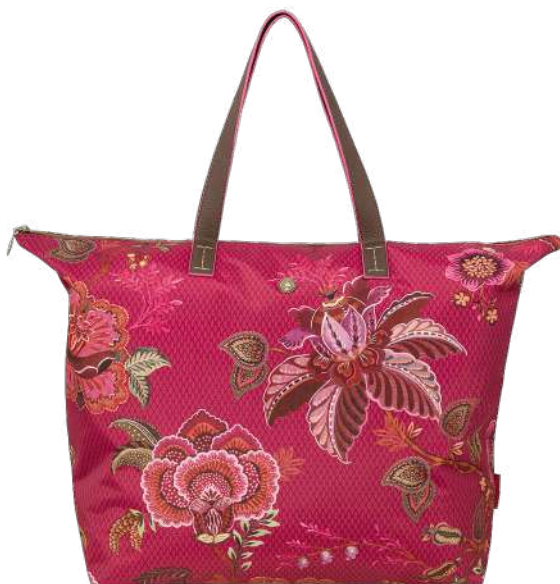
NEW | 51.273.383 Tilda Tote Bag 66x20x44 cm Cece Fiore Red 60% Polyester - 30% PVC - 10% PU Compartment: 1 - Pockets: 3 - Ltr: 17 1/24