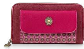
NEW | 51.273.377 Wally Wallet Pocket 19.5x4.5x11 cm Red 40% PU - 30% PVC - 30% Polyester Compartment: 2 - Pockets: 3 Fits 16 cards 1/60