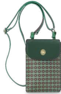
NEW | 51.273.387 Pippa Phone Bag 13.5x3x20 cm Clover Green 40% PU - 30% PVC - 30% Polyester Compartiments: 3 - Pocket: 1 - Ltr: 0.1 Fits 3 cards 1/48