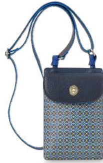
NEW | 51.273.369 Pippa Phone Bag 13.5x3x20 cm Clover Blue 40% PU - 30% PVC - 30% Polyester Compartment: 3 - Pocket: 1 - Ltr: 0.1 Fits 3 cards 1/48