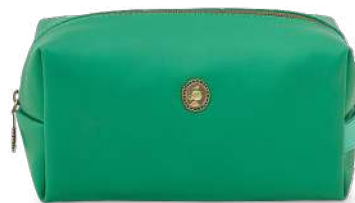
NEW | 51.274.246 Coco Cosmetic Bag Large 26x12x12.6 cm Green 40% PU - 30% PVC - 30% Polyester Compartment: 1 - Pockets: 2 - Ltr: 3 1/18