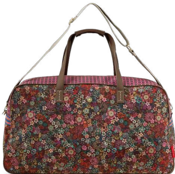
51.273.365 - Weekend Bag Medium 57x22x37 cm - Ltr: 33 NEW | 51.273.384 - Tovy Weekend Bag Large 65x25.5x35 cm - Ltr: 46 Tutti i Fiori Pink 60% Polyester - 30% PVC - 10% PU Compartment: 1 - Pockets: 2 Detachable strap 1/12