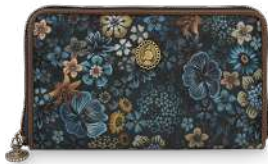
51.273.349 Wallet 18x3x11 cm Tutti i Fiori Blue 50% Polyester - 40% PVC - 10% PU Compartment: 1 - Pockets: 5 Fits 5 cards 1/60