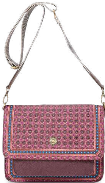
51.273.351 Cross Body Flap 25x7x20 cm Clover Pink 60% PVC - 30% Polyester - 10% PU Compartments: 2 - Pockets: 3 - Ltr: 2 Detachable strap 1/12