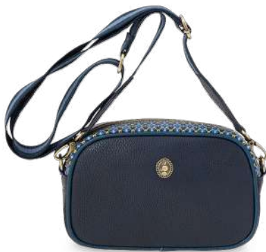
NEW | 51.273.370 Frida Cross Body Bag Small 21x6x13 cm Blue 40% PU - 30% PVC - 30% Polyester Compartment: 1 - Pockets: 2 - Ltr: 1.2 Detachable strap 1/24