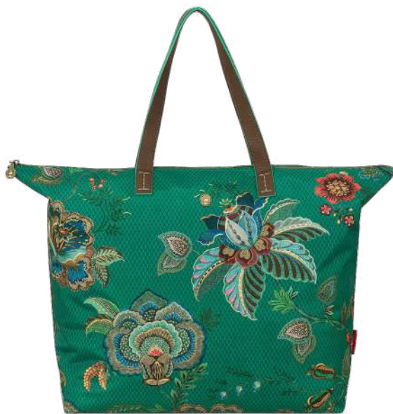
NEW | 51.273.392 Tilda Tote Bag 66x20x44 cm Cece Fiore Green 60% Polyester - 30% PVC - 10% PU Compartment: 1 - Pockets: 3 - Ltr: 17 1/24