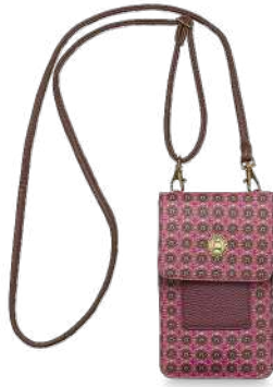
51.273.353 Phone Bag 11x1x18 cm Clover Pink 90% PVC - 10% PU Compartment: 1 - Pocket: 1 - Ltr: 0.1 Detachable strap 1/48