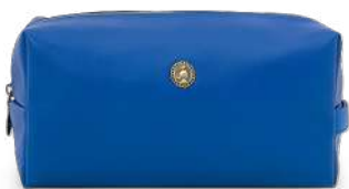
NEW | 51.274.229 Coco Cosmetic Bag Medium 21.5x10x10.5 cm Blue 40% PU - 30% PVC - 30% Polyester Compartment: 1 - Pockets: 2 - Ltr: 1.5 1/24