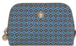
NEW | 51.274.231 Coby Cosmetic Bag Triangle Small 19/15x6x12 cm Clover Blue 60% Polyester - 40% PVC Compartment: 1 - Pockets: 2 - Ltr: 0.5 1/36