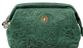
51.274.173 Cosmetic Purse Small 19x8.5x12 cm Velvet Quiltey Green 60% Polyester Velvet - 40% PVC Compartment: 1 - Pockets: 2 - Ltr: 1 1/36