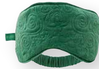
51.530.011 Sleeping Mask One size Velvet Quiltey Days Green 100% Polyester Velvet 1/200