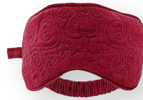
51.530.009 Sleeping Mask One size Velvet Quiltey Days Red 100% Polyester Velvet 1/200