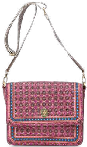
51.273.352 Cross Body Flap Small 19x6x16 cm Clover Pink 60% PVC - 30% Polyester - 10% PU Compartment: 1 - Pockets: 2 - Ltr: 1.3 Detachable strap 1/24