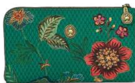
NEW | 51.274.251 Cloe Cosmetic Zipper Pouch 21x3.5x12.5 cm Cece Fiore Green 60% Polyester - 40% PVC Compartment: 1 - Ltr: 0.1 1/64