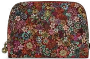
NEW | 51.274.240 Coby Cosmetic Bag Triangle Medium 24/17x8x16.5 cm Tutti i Fiori Pink 60% Polyester - 40% PVC Compartment: 1 - Pockets: 3 - Ltr: 1.2 1/24