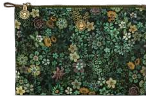
NEW | 51.274.249 Charly Cosmetic Flat Pouch Medium 24x1x15.5 cm Tutti i Fiori Green 60% Polyester - 40% PVC Compartment: 1 - Pocket: 1 - Ltr: 0.3 1/48