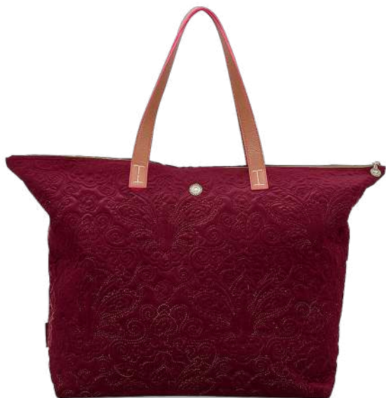
51.273.315 Tote Bag 66x20x44 cm Velvet Quiltey Days Red 60% Polyester Velvet - 30% PVC - 10% PU Compartment: 1 - Pockets: 3 - Ltr: 17 1/24