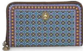
51.273.350 Wallet 18x3x11 cm Clover Blue 60% PVC - 20% PU - 20% Polyester Compartment: 1 - Pockets: 5 Fits 5 cards 1/60