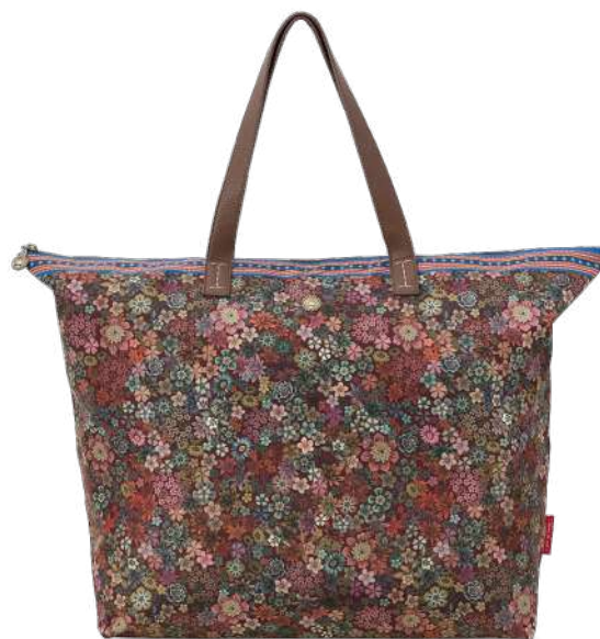
51.273.362 Tote Bag 66x20x44 cm Tutti i Fiori Pink 60% Polyester - 30% PVC - 10% PU Compartment: 1 - Pockets: 3 - Ltr: 17 1/24