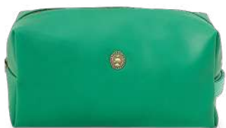
NEW | 51.274.245 Coco Cosmetic Bag Medium 21.5x10x10.5 cm Green 40% PU - 30% PVC - 30% Polyester Compartment: 1 - Pockets: 2 - Ltr: 1.5 1/24