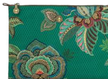
NEW | 51.274.252 Charly Cosmetic Flat Pouch Large 30x1x22 cm Cece Fiore Green 60% Polyester - 40% PVC Compartment: 1 - Pocket: 1 - Ltr: 0.4 1/60