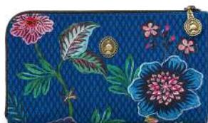
NEW | 51.274.235 Cloe Cosmetic Zipper Pouch 21x3.5x12.5 cm Cece Fiore Blue 60% Polyester - 40% PVC Compartment: 1 - Ltr: 0.1 1/64