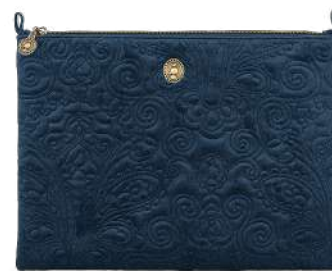
51.274.208 Cosmetic Flat Pouch Large 30x1x22 cm Velvet Quiltey Days Blue 60% Polyester Velvet - 40% PVC Compartment: 1 - Pocket: 1 - Ltr: 0.4 1/60