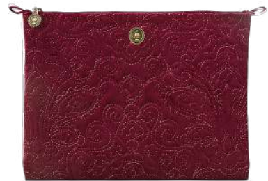
51.274.191 Cosmetic Flat Pouch Large 30x1x22 cm Velvet Quiltey Days Red 60% Polyester Velvet - 40% PVC Compartment: 1 - Pocket: 1 - Ltr: 0.4 1/60