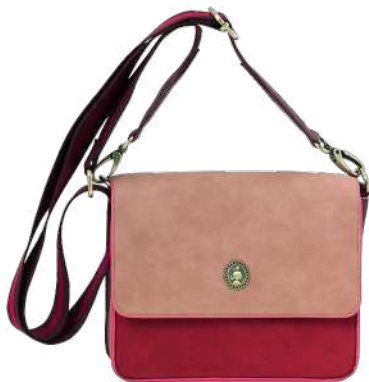
NEW | 51.273.381 Fenna Cross Body Flap Small 19x6x16 cm Red 50% PU - 50% Polyester Compartment: 1 - Pockets: 2 - Ltr: 1.3 Detachable strap 1/24