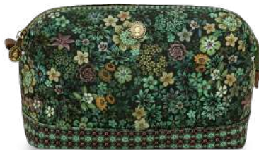
NEW | 51.274.250 Cooper Cosmetic Purse Large 26x12x18 cm Tutti i Fiori Green 60% Polyester - 40% PVC Compartment: 1 - Pockets: 3 - Ltr: 4 1/24