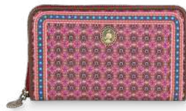
51.273.355 Wallet 18x3x11 cm Clover Pink 60% PVC - 20% PU - 20% Polyester Compartment: 1 - Pockets: 5 Fits 5 cards 1/60