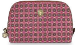
NEW | 51.274.239 Coby Cosmetic Bag Triangle Small 19/15x6x12 cm Clover Pink 60% Polyester - 40% PVC Compartment: 1 - Pockets: 2 - Ltr: 0.5 1/36