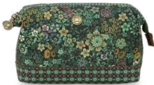
51.274.224 Cosmetic Purse Medium 22.5x9.5x15 cm Tutti i Fiori Green 60% Polyester - 40% PVC Compartment: 1 - Pockets: 2 - Ltr: 2.3 1/36