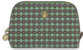
NEW | 51.274.247 Coby Cosmetic Bag Triangle Small 19/15x6x12 cm Clover Green 60% Polyester - 40% PVC Compartment: 1 - Pockets: 2 - Ltr: 0.5 1/36