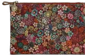
NEW | 51.274.241 Charly Cosmetic Flat Pouch Medium 24x1x15.5 cm Tutti i Fiori Pink 60% Polyester - 40% PVC Compartment: 1 - Pocket: 1 - Ltr: 0.3 1/48