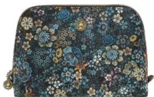
NEW | 51.274.232 Coby Cosmetic Bag Triangle Medium 24/17x8x16.5 cm Tutti i Fiori Blue 60% Polyester - 40% PVC Compartment: 1 - Pockets: 3 - Ltr: 1.2 1/24