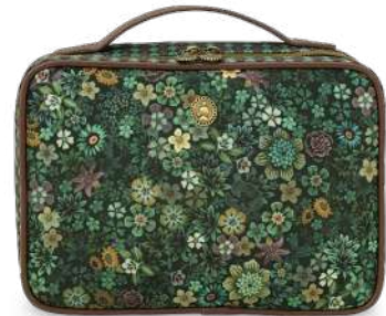
51.274.226 Beauty Case Square Large 27x10x19 cm Tutti i Fiori Green 60% PVC - 40% Polyester Compartments: 2 - Pockets: 2 - Ltr: 4 1/12