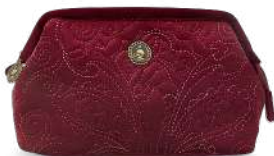
51.274.188 Cosmetic Purse Small 19x8.5x12 cm Velvet Quiltey Days Red 60% Polyester Velvet - 40% PVC Compartment: 1 - Pockets: 2 - Ltr: 1 1/36