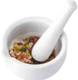
89084 Mortar MACINO • Ø 10 cm