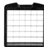
13 x 13 mm