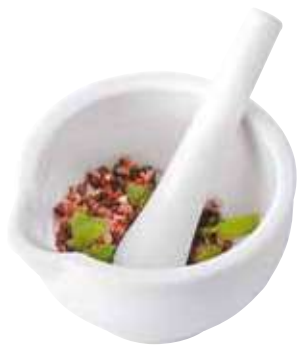
89085 Mortar MACINO • Ø 13 cm