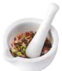
89083 Mortar MACINO • Ø 7.7 cm