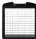
7 x 7 mm